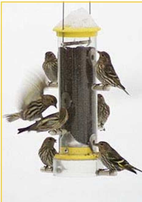
There was a massive southern movement of pine siskins during the 2008-09 season.

Project FeederWatch is for people of all ages and skill levels. To learn more and to sign up, visit www.feederwatch.org or call the Cornell Lab toll-free at 866-982-2473. In return for the $15 fee ($12 for Cornell Lab members) participants receive the Feeder Watcher's Handbook , an identification poster of the most common feeder birds, a calendar, complete instructions, and Winter Bird Highlights , an annual summary of FeederWatch findings.